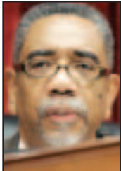
U.S. Rep. Bobby L. Rush